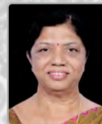
Smt. Ranjanben Bhatt Member of Parliament Vadodara