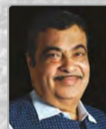
Shri Nitin Gadkari Union Minister Govt. of India