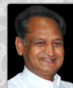
Shri Ashok Gehlot Chief Minister Rajasthan