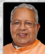
Shri Kalraj Mishra Hon'ble Governor Rajasthan

the vice-chancellors to send a progress report to the Raj Bhavan by the seventh of every month in this regard. The Governor has said that an awareness campaign should be launched to rescue villages from coronavirus infection. Universities will now have to make the villagers aware of health protocols, social distancing norms, use of face masks and sanitisers. He said that the social obligation of universities have now increased towards villages. The Governor said the Smart Village Initiative, a village adoption scheme by universities, has been renamed as "University Social Responsibility".