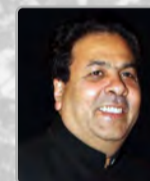
Shri Rajeev Shukla Former Union Minister Govt. of India