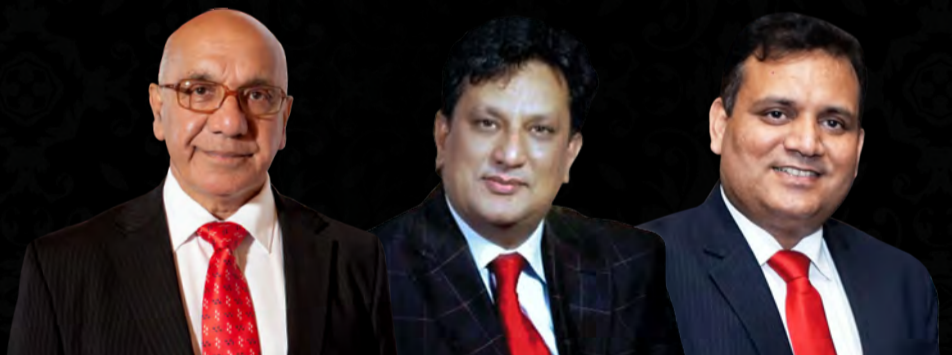
Shri Virendra Sharma Member of Parliament England