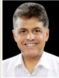
Shri Manish Tewari, MP