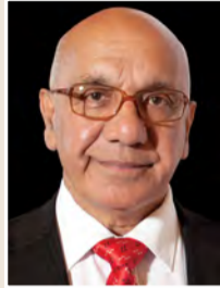
Shri Virendra Sharma