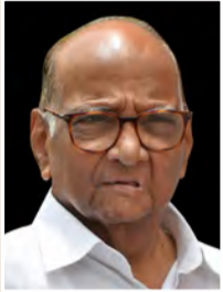
Shri Sharad Pawar