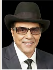
Shri Dharmendra Deol