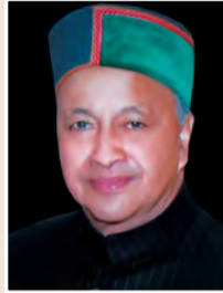
Shri Virbhadra Singh