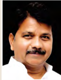
Shri Bala Bachchan, MLA