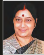
Smt. Sushma Swaraj Cabinet Minister Govt. of India