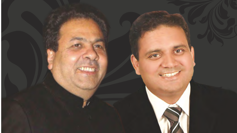
राजीव शुक्ला पूर्व केन्द्रीय मंत्री

AISPC has authorized body to provide Excellence Awards and Felicitations for outstanding performance in all fields.