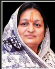
Smt. Malini Gaud Mayor, Indore