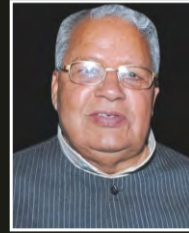
Shri Kalraj Mishra Cabinet Minister Govt. of India