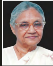
Smt. Sheila Dikshit Ex. Chief Minister Delhi