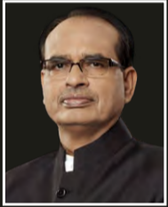
Shri Shivraj Singh Chouhan Chief Minister Madhya Pradesh