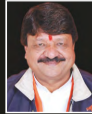
Shri Kailash Vijayvargiya Minister Govt. of M.P.