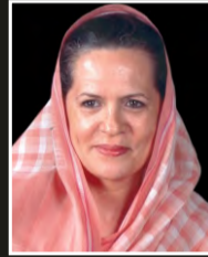
Smt. Sonia Gandhi President All India Congress Committee