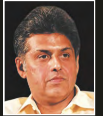
Shri Manish Tewari Ex. Cabinet Minister Govt. of India