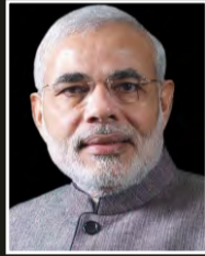
Shri Narendra Modi Prime Minister India