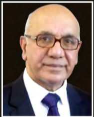
Shri Virendra Sharma Member of Parliament London (UK)