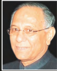
Justice V.S. Kokje Ex. Governor Himachal Pradesh