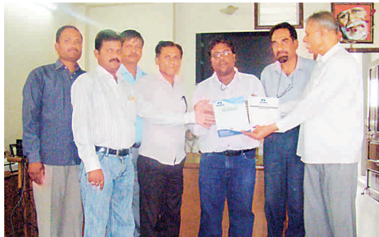
अल्मा अजमेर के शाखा प्रबंधक को प्रमाण पत्र देते हुए अल्मा पदाधिकारीगण।